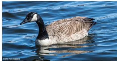
Adult Canada Goose seen on a walk in Hammond Pond Woods

There are geese, and then there are geese. Let me explain.