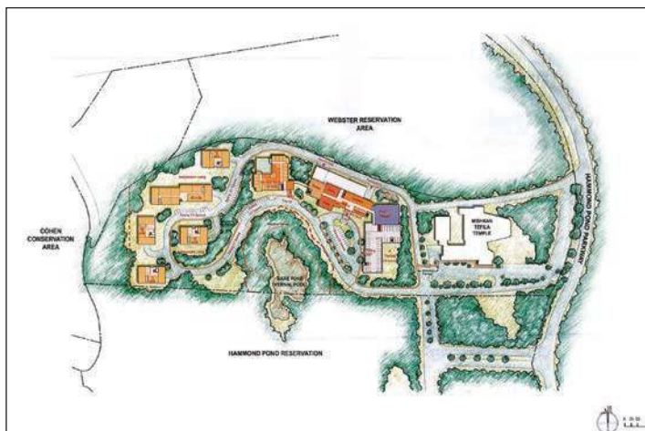
This drawing presents a development that could be possible around the wetlands.

While Bare Pond and a small buffer zone around it is protected from development by state wetlands regulations, most of the land could be developed by Boston College for use as dorms, classrooms or office buildings, or parking lots. Such development would be a devastating blow to a beloved conservation area.