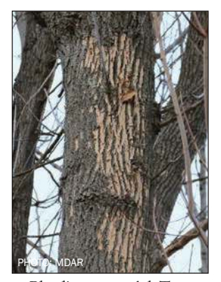
Blonding on an Ash Tree

A more reliable indicator is unusually high woodpecker activity on an ash; that's what led to EAB detection in Concord, N.H., in 2013. Woodpeckers pecking for EAB larvae and pupa can also cause the outer layer of bark to flake off, creating a "blonding" effect on the tree trunk.