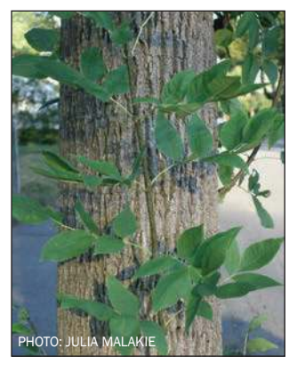
Ash leaves and bark

The website emeraldashborer.info has information on all aspects of the EAB problem and efforts to combat it, including a report on the effectiveness of different insecticide options.