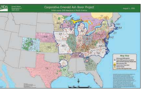
Map of Initial County Detections

EAB arrival in a new area include: 1) the use of traps (purple or green) usually with a pheromone or other lure; 2) "trap trees" intentionally girdled so the scent of the cut will attract the beetle, and 3) Wasp Watchers, a program to monitor colonies of the Cerceris fumipennis wasp, a native, nonstinging, ground-nesting wasp which hunts Buprestid beetles generally, and will find EAB if it's nearby. The first EAB in Connecticut were found at a Wasp Watchers' site.