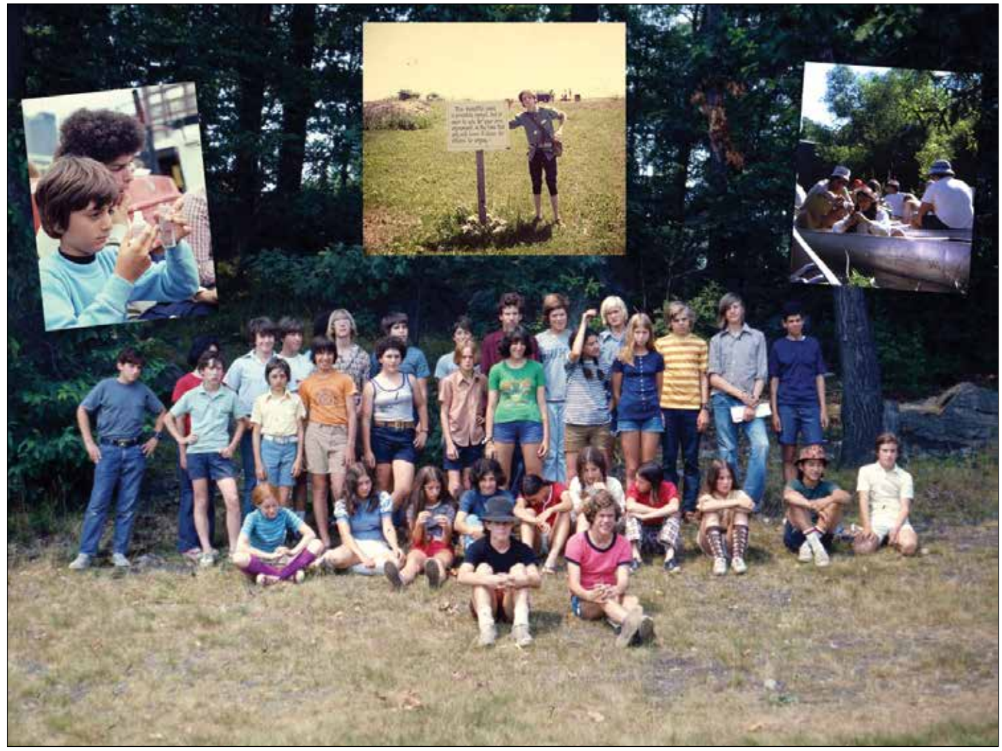
Environmental Science Program Groups - 1970s and 1980s