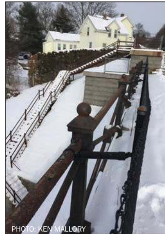
Echo Bridge Railing