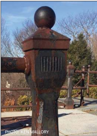
Close up of Railing

Plans to advance the historic railing reconstruction took a big step forward with two approvals—one from the Newton Upper Falls Historic District Commission on November 11, 2016, and one by the Needham Historical Commission two weeks later. MWRA and Committee members developed a Railing Reconstruction Plan based on the 2007 study.