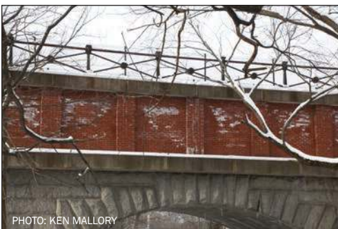
Close up of Granite and Brick