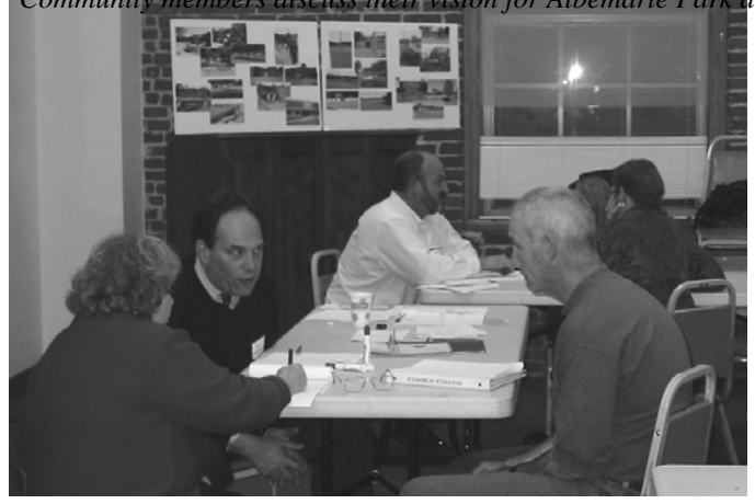
the November meeting.

The major stakeholders and users of the site have been vital participants in the design process. The Friends of Albemarle Park has served as a link to the Community members discuss their vision for Albemarle Park ut