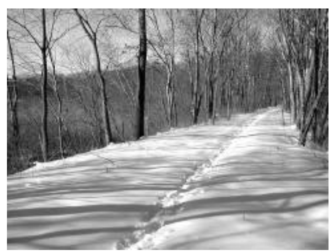
Oak Hill Path between Sawmill Brook and Wells Ave