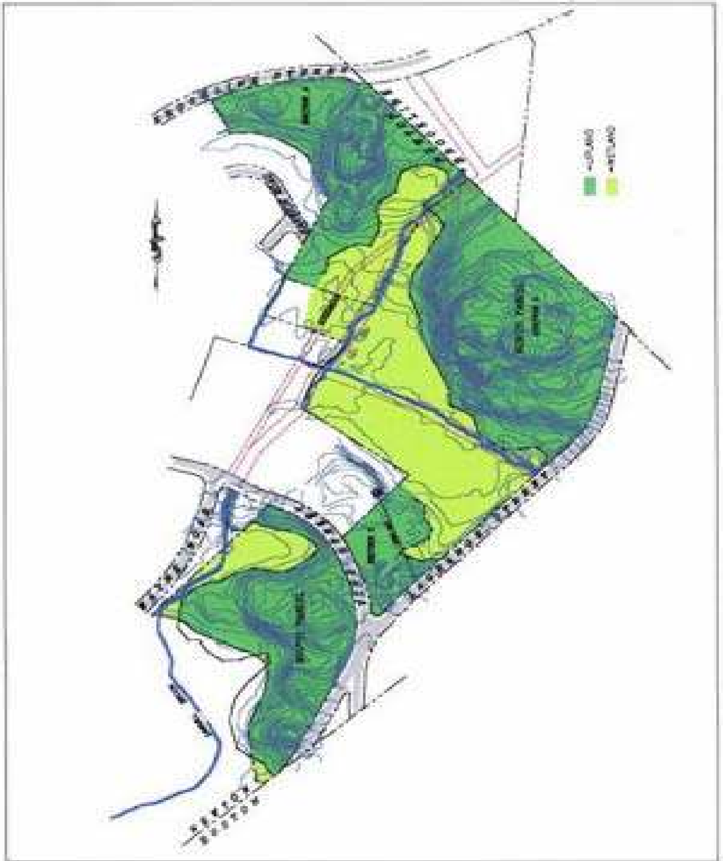
Map of North Parcel (showing Sections A, B and C) and South Parcel of West Kessler Woods. Dark areas are uplands and lighter areas are wetlands. Map taken from Insignia website ( www.lagrangelandsale.com ), which lists terms and conditions of NStar sale of West Kessler Woods.