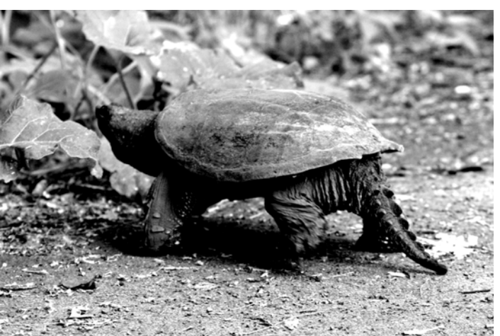
Photo of a turtle on a jaunt along the Charles River Pathway