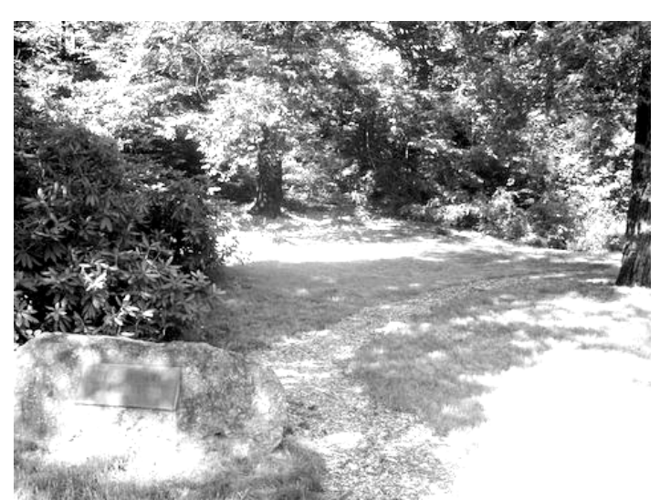
A grassy area at Ordway Park, as seen from the corner of Gibbs and Everett Streets

This past year, major steps have been taken to renew Ordway Park. In an effort initiated by neighbors, an Ordway Park endowment fund with a goal of $50,000 has been established. A neighbor donated a matching grant of $10,000, of which now only $700 remains to be raised. Last spring, granite