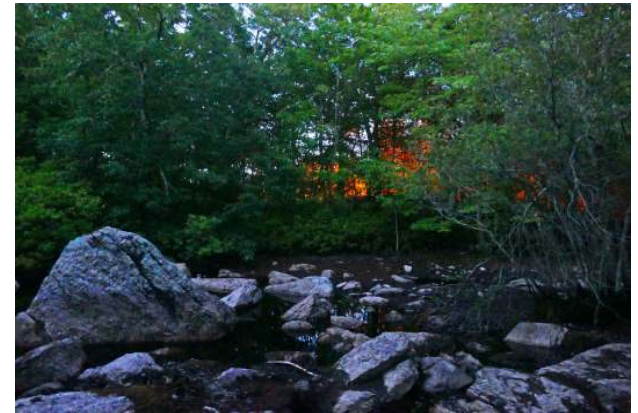
Bare Pond in the evening. Lights from the MASCO parking lot illuminate the trees at rear.