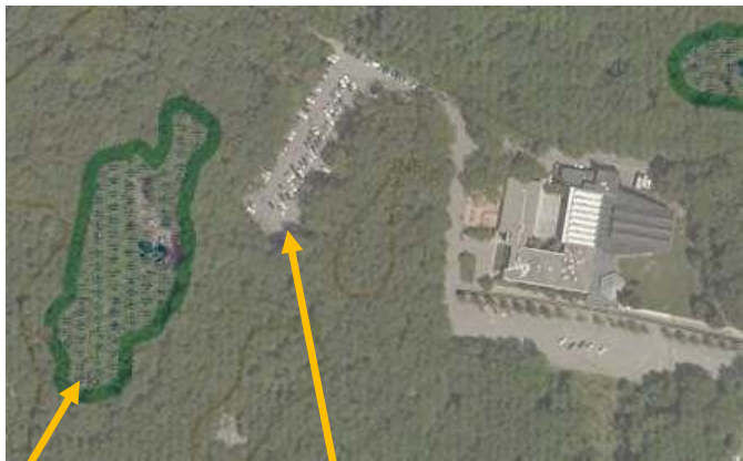
Bare Pond wetlands

The rear MASCO parking lot, west of the main building, is adjacent to the Bare Pond wetlands.