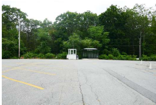
View of the MASCO (Medical Academic and Scientific Community Organization) parking lot. Shuttle buses take commuters to jobs in the Longwood Medical Area in Boston.