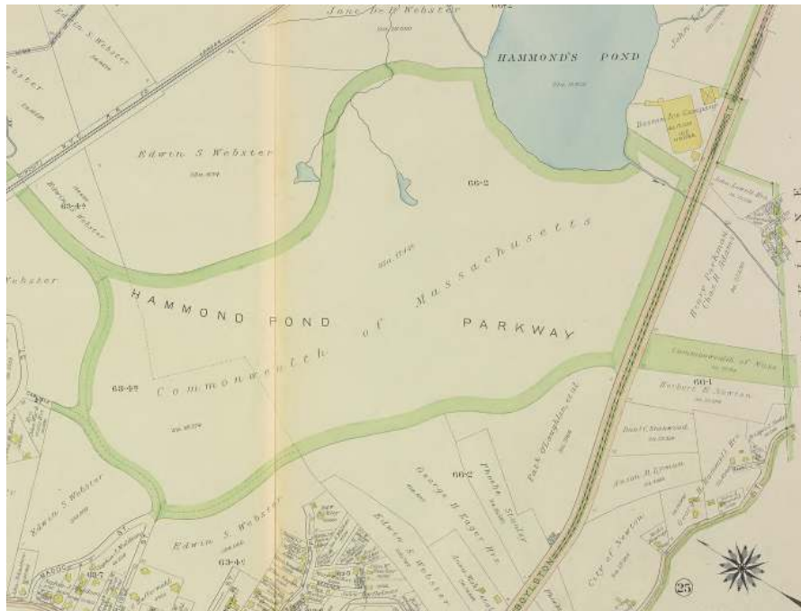
Webster Woods and Hammond Pond early in the 20 th century

We have a rare second chance to mitigate the impact of a bad decision made 60 years ago.