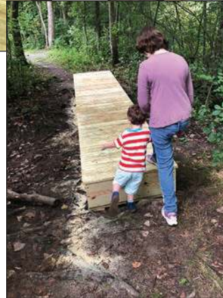
Nahanton Park visitors are the first to test the new temporary bridge along Florrie's Path.