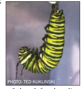
J shape before chrysalis

The next morning "magic" happens as the caterpillar straightens out a bit and begins some movement. The caterpillar's skin splits open at the head, and as it wriggles, the skin splits further and rolls up toward the tail, revealing what looks like