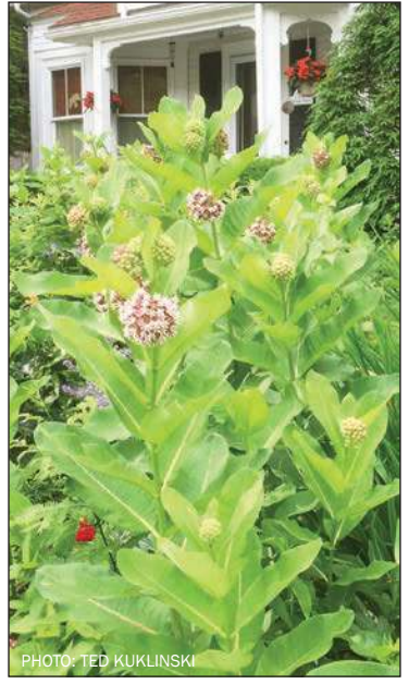
Milkweed in garden

Monarch butterflies lay their eggs only on milkweed, and their population is being threatened by loss of milkweed habitat and the use of pesticides. And in our experience over recent years, sightings of monarchs were fewer and fewer, some seasons only resulting in two or three sightings.