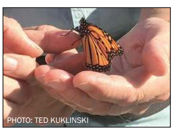
Monarch in hand prior to release

Periodically, it will open its wings and close them again the process of drying them. "Wow — look at me!" it may be thinking. In the next hour, it may take its first tentative steps away from its former chrysalis shell, continuing to fan its wings. After about two to three hours, the Monarch should