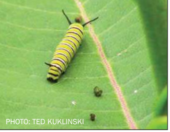
Juvenile caterpillar with frass

frass — a polite word for caterpillar poop.