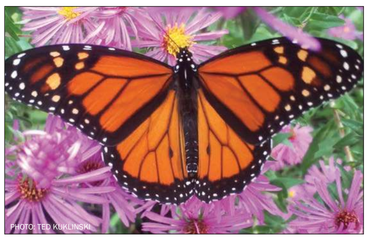
Male Monarch on asters, note dark spots on the wing.

any years ago, we got some wildflower seed packs and started a garden in our front yard in place of grass. One year we noticed a new plant in the far corner of the yard. When it flowered later, we learned that this plant was common milkweed. Over a few years it spread farther and farther with our encouragement until we had a sizeable stand of it throughout the lawn surrounding our modest flower garden.