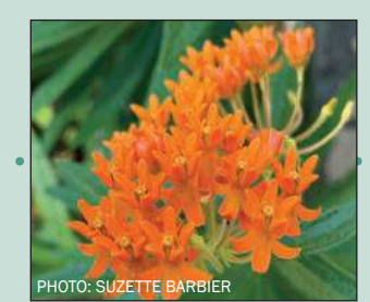
Asclepias tuberosa Butterfly Weed