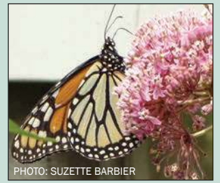
Asclepias incarnata Swamp Milkweed