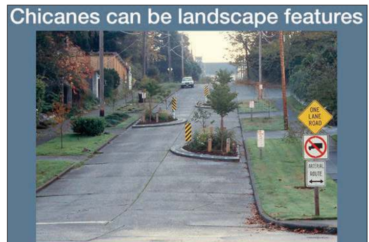
An example of chicanes, twists and turns in the roadway