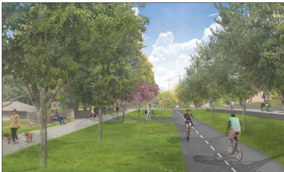
Designer's sketch of the plan for Commonwealth Avenue at Lyons Park in Auburndale

Commonwealth Avenue. In much of Newton, the Commonwealth Avenue carriageway is a shared use/ neighborhood way. When the RGWG became aware that MassDOT will be replacing the Route 30 Charles River Bridge in 2022 and that Weston was planning to install a shared-use trail along the length of Route 30, we approached MassDOT to include a shared-use trail over the bridge with access to Norumbega Road. We then suggested the city of Newton convert the north side of Commonwealth Avenue from Lyons Field to the Bridge to a separated, shared use path. Both these are now being designed. The city has completed the 25% design and