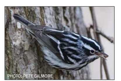
Black and White Warbler.