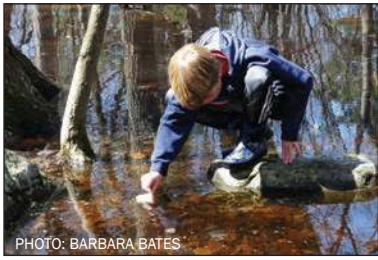
Exploring a vernal pool.

Each program will begin at 7 pm and last approximately one hour. Please register in advance for each webinar since registrations will close at 3 PM on the day of the event . You may register for the programs using the links below or by going to the event listing at NewtonConservators.org . You will receive an email confirmation after you have registered. If after registering you cannot attend, please cancel your reservation (as indicated on your confirmation) so that someone else may use the slot. Registration is limited to 100 slots.