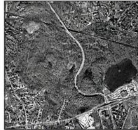
In the 1950s, the Metropolitan District Commission had begun selling some of the woodlands, near Hammond Pond for development of parking for the new Chestnut Hill Shopping Center.

After World War II, returning veterans and their families had trouble finding affordable homes in Newton. The city reacted creatively to this shortage by taking a large tract of land in Oak Hill by eminent domain and building affordable homes there. As the decade progressed, shopping centers and industrial and office buildings, as well as more homes and apartment buildings, were built across the city. Boston College, which had been a six-building complex, expanded rapidly. The Metropolitan District Commission (now