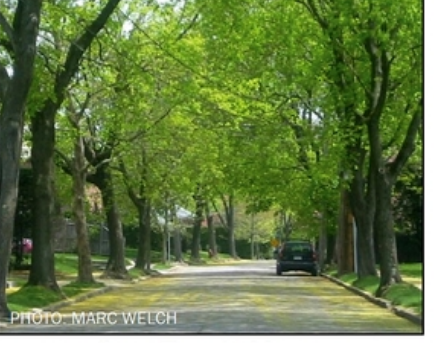
Street Trees in Newton

Trees growing along the roadways of Newton have been a part of the fabric of the community for over 100 years. How did these trees get here? What is their importance? What can we expect in the future? The City's street trees provide incredible benefits to the public but also require thoughtful care, planning and perspective. We will look at how the trees and their care have evolved over the years. We also will discuss ways to ensure these trees remain assets to the community.