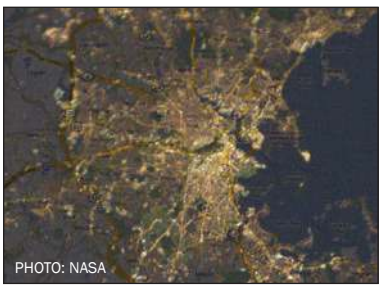
The City of Boston at Night