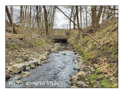
South Meadow Brook

Each program will begin at 7 pm and last approximately one hour. You may register for the programs using the links below or by going to the event listing at newtonconservators.org. You will receive an email confirmation after you have registered.