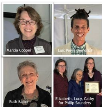
Newton Conservators Awardees

It has been a whirlwind of events this Spring so far and we have a bunch more still to come! Thanks to those who attended any of them so far - whether a walk, webinar, fair, or invasive removal!