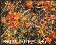
Oriental bittersweet

Newton Conservators' Invasives Team conducts invasive plant removal sessions year-round, in many of Newton's parks and conservation areas. The City of Newton and the state (Department of Conservation and Recreation) support us administratively and with debris removal.